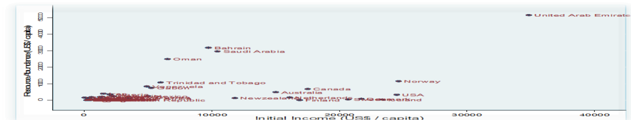
Figure 2 Plot of Resource Abundance and Initial Income